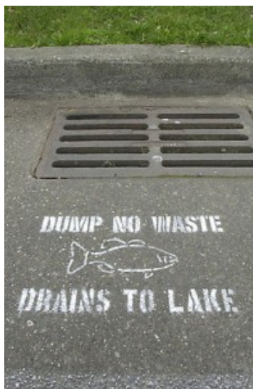
Stencil a Storm Drain Help protect water quality

Sign up to stencil storm drains in your neighborhood with the message: